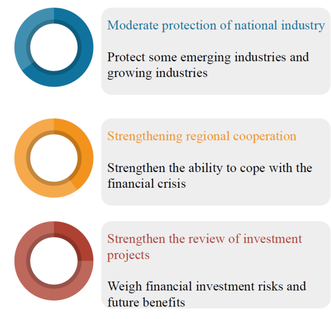
Figure 2 Financial investment countermeasures under the background of "the Belt and Road"

The main goal of the "the belt and road initiative" initiative is to strengthen cooperation among countries and achieve regional economic development. China should actively consult with partner countries to get local authorities to allow Chinese financial investors to enter relevant industries, so as to stimulate local development. Compared with domestic investment, foreign financial investment faces greater risks. Therefore, it is necessary to build a sound financial investment risk early warning system and supervision and management mechanism. At present, China's financial supervision of foreign investment is not perfect, and the lack of supervision mechanism not only brings risks to foreign financial investment, but also leads to the waste of financial resources. The financial investment countermeasures of China under the background of "the belt and road initiative" are shown in Figure 2.